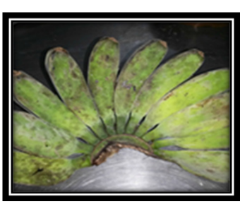
Figure 1. Saba banana [ Musa 'saba' (Musa acuminata x Musa balbisiana) ] fruit

Optimization of ripeness stage of banana peels was also performed using banana peels from ripe and unripe bananas. Pectin was extracted using 0.5N HCl, pH 1.5, for 3 h. The extracted pectin from ripe and unripe banana peels were analyzed for their chemical characteristics.