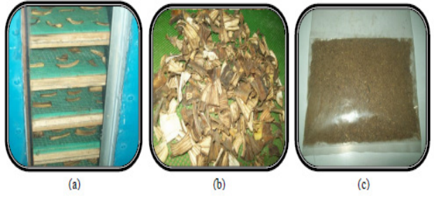
Figure 2. Saba banana peel powder preparation. (a) ovendrying of banana peels (b) banana peels after drying (c) banana peels after grinding