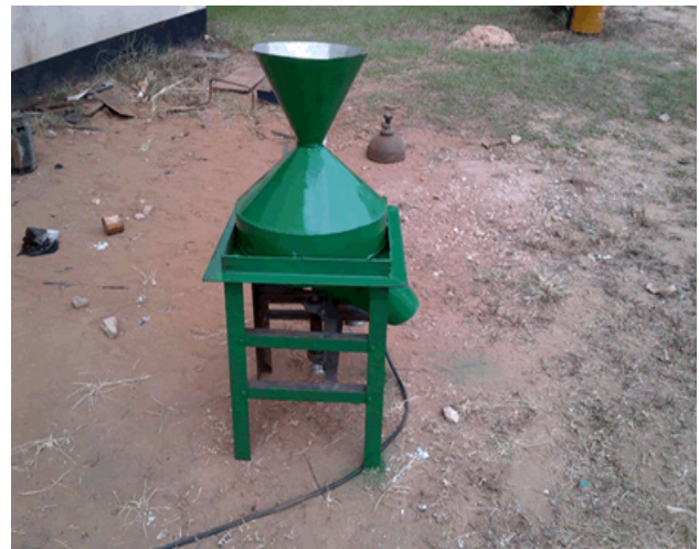
Figure 2. Bambara groundnut sheller

The machine consists of a feed hopper, the cracking chamber, impeller, shaft, bearings, pulley, frame and an electric motor. The machine has three major sections, namely the hopper, the pod shelling unit and the power transmission unit. The frustum framed hopper is fixed to the cracking unit top cover, the shelling unit consists of a 400 mm diameter by 100 mm height cylindrical shell made from mild steel sheets whose inner surface serves as the cracking surface. The impeller is made from a 25 mm by 50 mm rectangular steel pipe, with slots positioned 45° to the tangents of the slot outlet (Oluwole, Abdulrahim and Oumarou, 2007). A shaft drives the impeller through a system of pulley and belt, placed in a concentric and horizontal manner with the allowance between impeller and cracking wall greater than the size of the pod. These components are assembled and mounted on a rectangular tool frame that gives the machine a compact design (Figure 2).