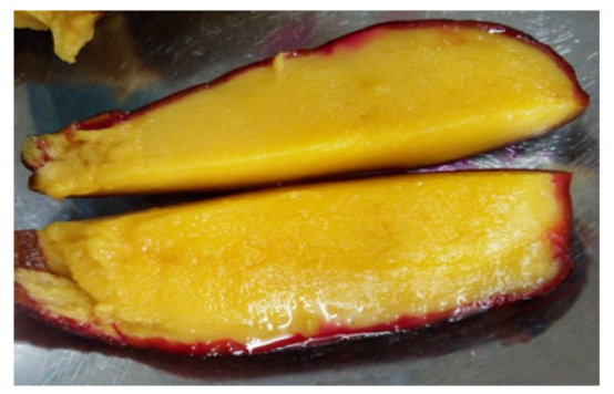
Figure 1. Penetration depth of NaOH analysis on 'Chok Anan' mango fruit

a magnifying glass was used to measure the depth of NaOH penetration (mm) (Kaleoglu et al. , 2004).