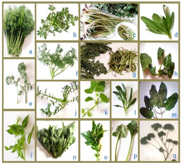
Figure 1. Wild species selected (edible parts analyzed): a. Foeniculum vulgare (young stems with leaves); b. Ammi majus (basal leaves); c. Scolymus hispanicus (mid-ribs of basal leaves); d. Calendula algeriensis (young leaves); e. Scandix pecten-veneris (basal leaves); f. Ridolfia segetum (young stems with leaves); g. Silybum marianum (mid-ribs of basal leaves); h. Emex spinosa (basal leaves); i. Mercurialis annua (aerial parts); j. Chrysanthemum coronarium (basal leaves); k. Urtica dioica (aerial parts); l. Silene vulgaris (tender stems with leaves); m. Rumex pulcher (Basal leaves); n. Papaver rhoeas (Basal leaves); o. Chenopodium murale (aerial parts); p. Beta macrocarpa (tender leaves); q. Lavatera cretica (tender stems with leaves)

parts were cut and homogenized and a minimum of 500 g was kept for analysis. Immediately after, a test portion of the fresh material was collected for the determination of water content. The rest of the sample was dried to constant weight at a temperature below 50°C and stored in a dry place, protected from light, pending completion of further analysis.